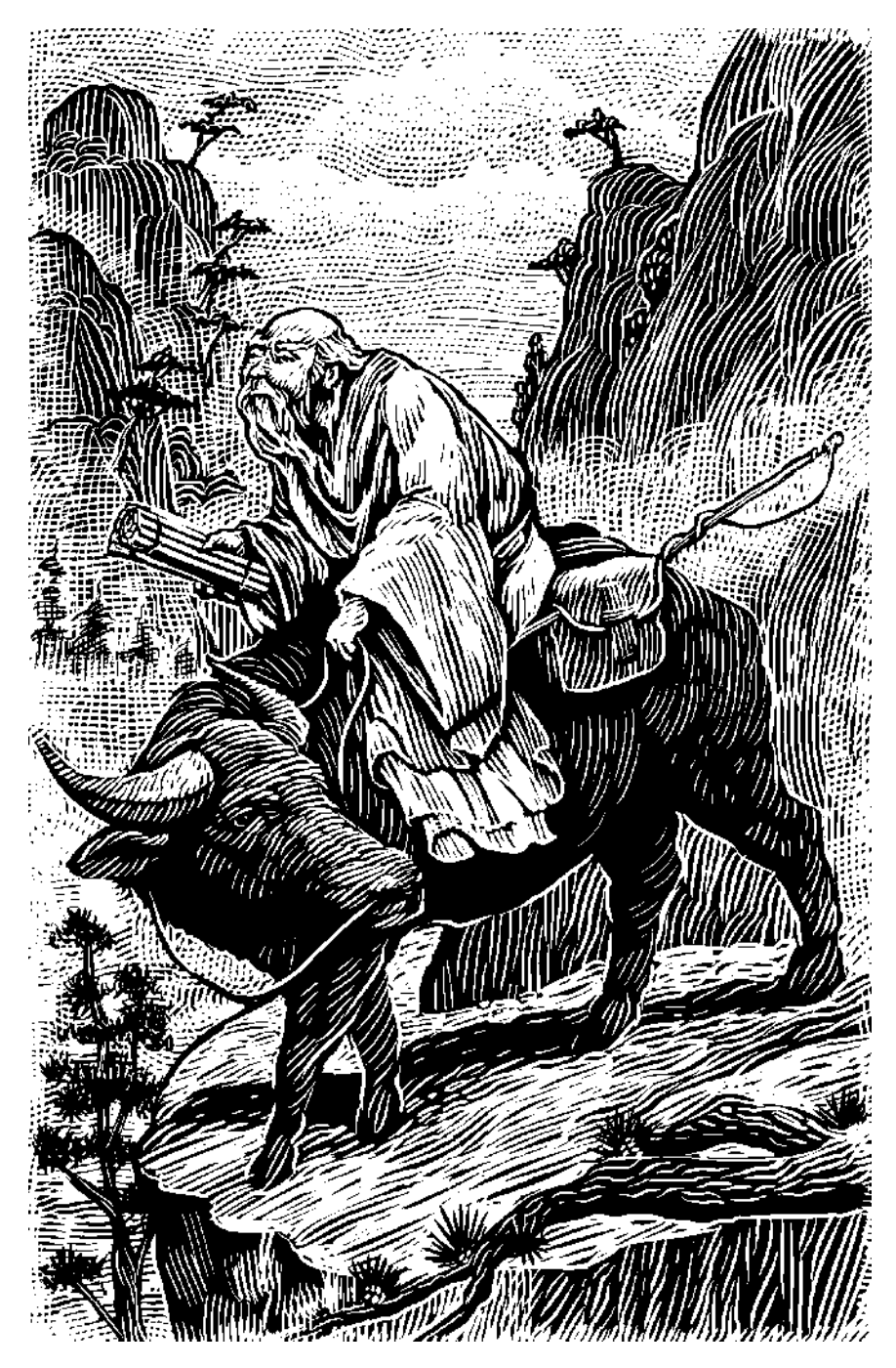
Laozi, "The Old Master," Retreats from the World, Leaving His Wisdom Behind