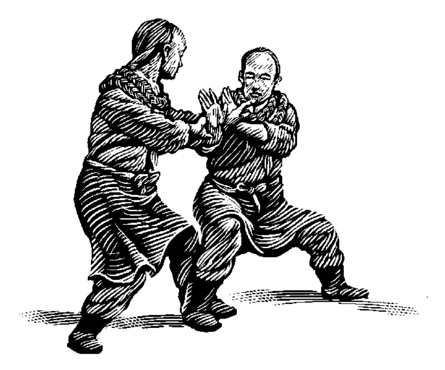
Tuishou: Zouhua and Niansui

The "Song of Push Hands," in its oral transfer of the art over centuries in ChenVillage, instructs the competitor to "guide [the opponent's] power into emptiness, then immediately attack."<sup>20</sup> To guide or lure the opponent into emptiness and thus destroy his balance is the very